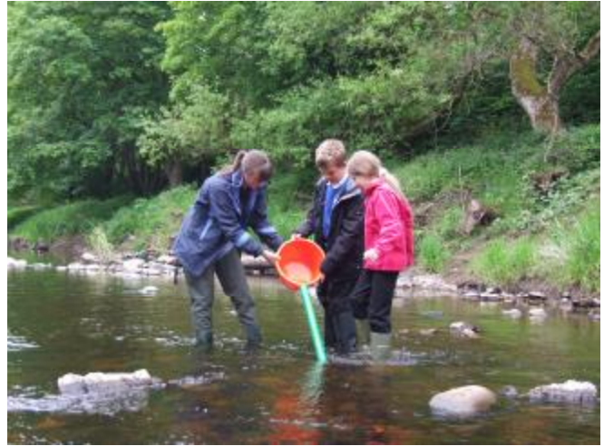
Dundonald pupils releasing their alevins into the River Irvine.

This day is timed to allow the hatched salmon alevins to develop in the classroom into a stage where they are ready for release into the wild (this is timed so that they are always released into the river before their yolk sac (internal food supply) is absorbed). The children assist with transporting the alevins to the local burn/river where they are released. This trip is normally quite short but it provides an opportunity for the children to link the earlier life stages with the natural habitat of salmon.